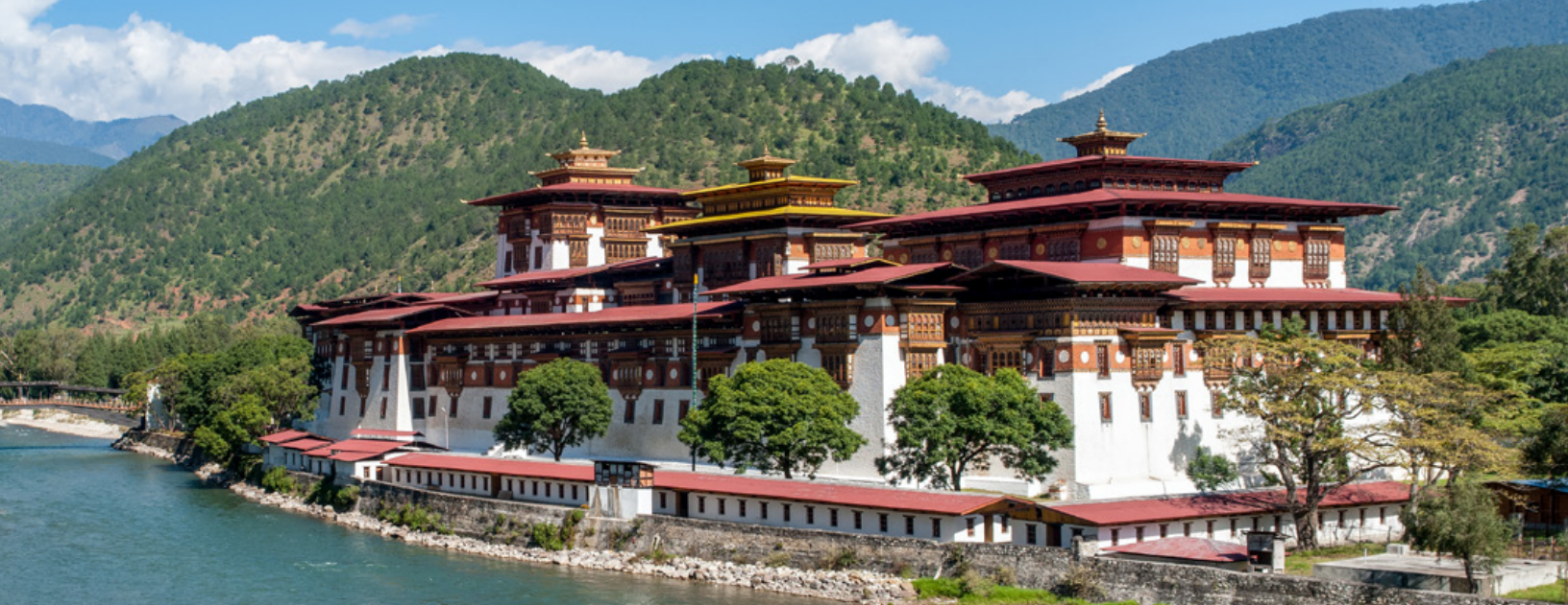
Punakha Dzong, one of Bhutan's oldest, largest, and most striking fortified monasteries