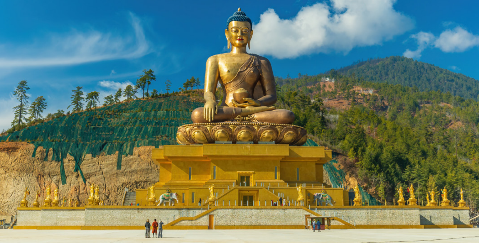
Great Buddha Dordenma in Thimphu, Bhutan