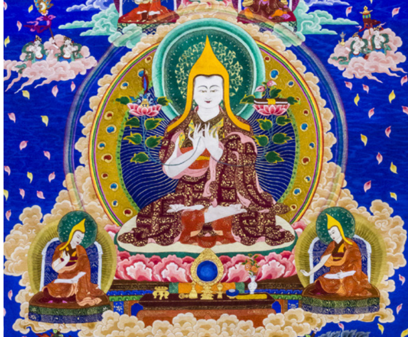
Left photo: Boudhanath Stupa in Kathmandu / Right photo: Thangka (Tibetan Buddhist painting on silk or cotton fabric)