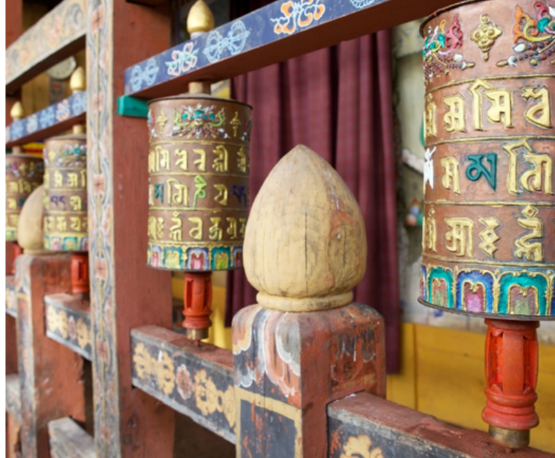
Left photo: Trongsang Dzong / Right photo: Prayer wheels at the Trongsang Dzong